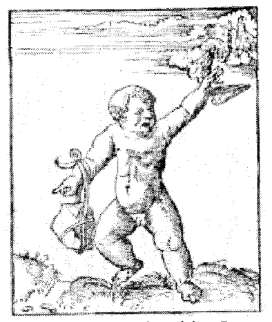
Genius constrained by Poverty Alciato, emblem no.121.

copied a number of images directly from it. The relevant emblematic image in this book is of a maiden partly seated and partly standing with a turtle in the left hand and wings in the right all set within an architectural frontispiece. Through the text it is connected to the motto festina lente, or 'hurry slowly.' In the ancient world, this saying 'make haste slowly' was attributed to Augustus (to whom Vitruvius dedicated his ten books).<sup>16</sup> The meaning is explained as to prudently combine speed with restraint. Aulus Gellius cites the phrase in defining the word "mature" as temperate or neither too soon nor too late, like fruit ripened in its proper time. To be premature is to be untimely or done too quickly.<sup>17</sup> Erasmus discusses the phrase from these classical sources in his 1508 edition of Adagia and expands it in each edition thereafter. From Erasmus and the Hypnerotomachia, it finds its way into Alciato's Emblemmata.