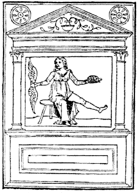
Hieroglyphe «Velocitatem sedendo» ... aus der Hypnerotomachia Poliphili.

The tools which surround the figure of constrained genius in Ryff's frontispiece are predominately surveying equipment. The visual source of the tools in the foreground is from another image in Cesariano's Vitruvius found in the eighth book on water.<sup>20</sup> Cesariano's caption for the drawing is "picture of instruments which people use for conducting water and which surveyors [agrimensor] use for leveling and for finding boundaries."21 The tools include water levels for finding the horizontal, plumb lines for the vertical and a theodolite for sighting precise angles. It was quite common to display the tools of the trade in a frontispiece, but it is important to note that they are not drawing instruments, but instruments for translating drawings into buildings. Similarly, the only book which openly presents its pages to the viewer is a book of practical or applied not theoretical, geometry. One other curious element is the bellows appearing from behind the putto's base fanning a fire in a double boiler like an alchemical experiment which may be a reference to the motto about testing gold by fire.